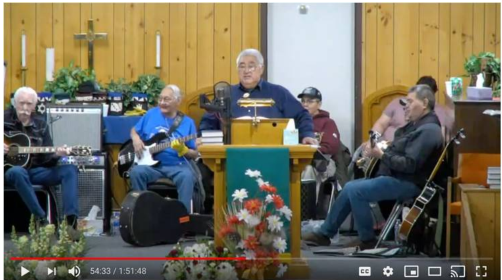
Livestreaming Funerals Before the Pandemic Utqiagvik Presbyterian Church

Weddings and funerals have been particularly difficult in this new Shelter-in-Place season. Many weddings have been postponed. We have heard of a few done online or over the phone, though the presbytery office has not heard of any within the congregations of our presbytery. Funerals of some sort are not as optional. We still have to bury the dead with as much dignity as we can muster. The Presbyterians have been as creatively active in this effort as any.