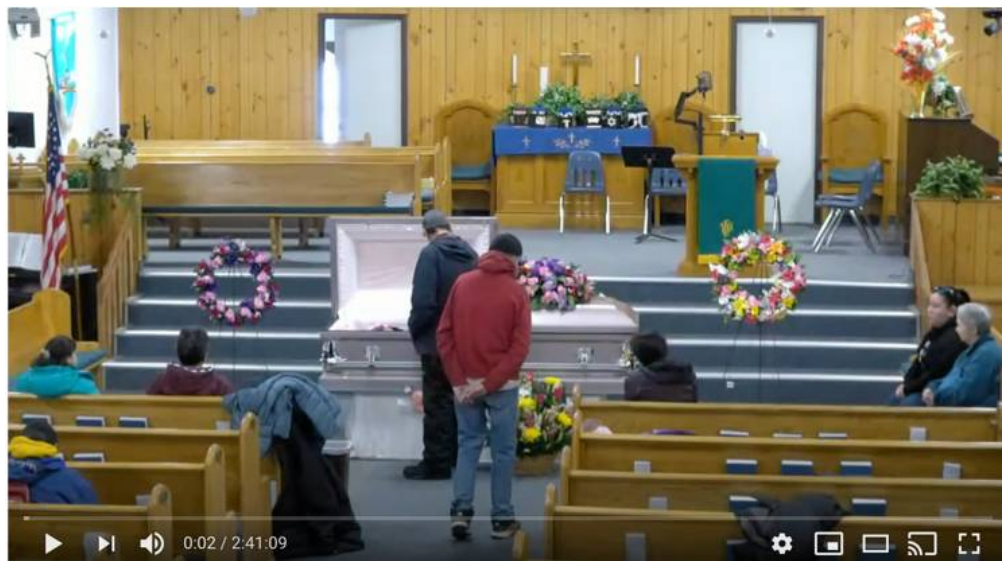
Livestreaming Funerals During the Pandemic

Many churches are planning some form of official memorial service at a later date, to allow people to gather, and grief in the way that many long for. For many, grieving requires hugging, and crying together, and gathering to share stories. Churches and families are looking for ways to offer these at a later date.