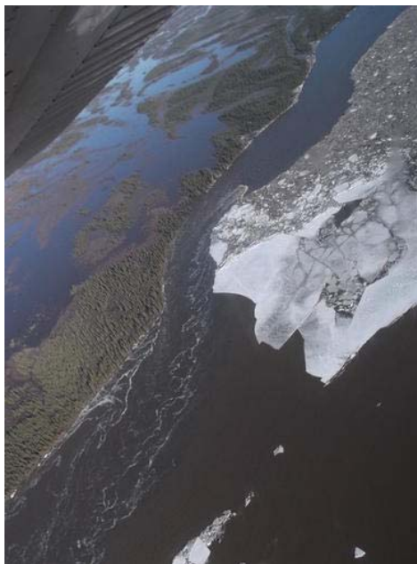
Ice Jam on the Yukon (Photo Courtesy Alaska National Weather Service, Alaska - May 22, 2013)

Additionally, as the water recedes and State of Alaska teams are able to assess the needs, there will be the need for volunteers to assist in the rebuilding of homes.